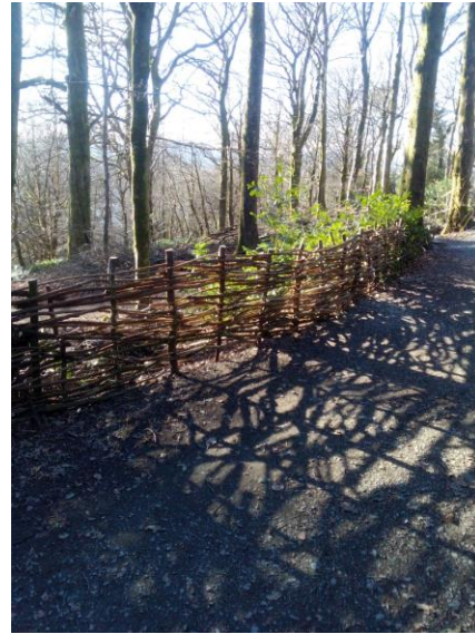
The new civic planting scheme and hurdle fencing in Elleray Woods

Wednesday 17 TH APRIL 2024 AT 6.00PM Marchesi Centre, Windermere